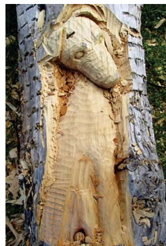
• A dog is starting to appear from the depths of this large log

Denise would still like non-carvers to come and bring suggestions and feedback. Anyone interested can contact Denise on 021 205 7172 or email madwoodcarver@gmail.com.