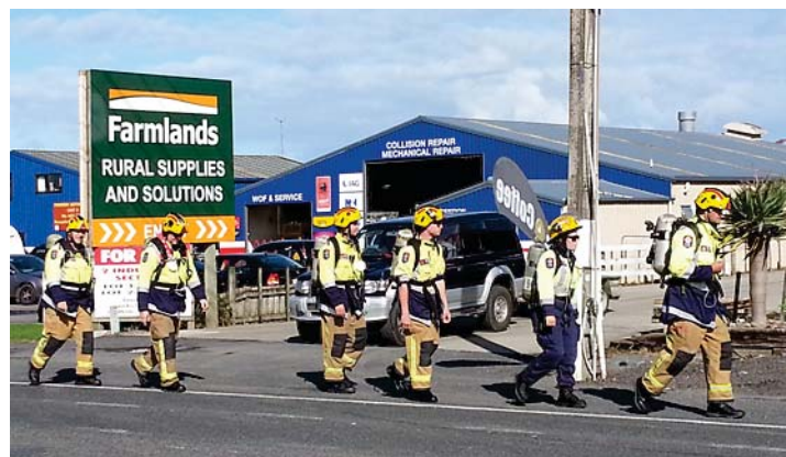
• The 'Waitangi walkers' in Mill Road as they leave Helensville

Two days before the team ran, the Helensville station hosted 12 fire fighters who walked more than 280km from Waitangi to take part in the Sky Tower climb. The guests bunked down in the fire station before heading off the next morning to Kumeu, on the final leg of their walk to Auckland.