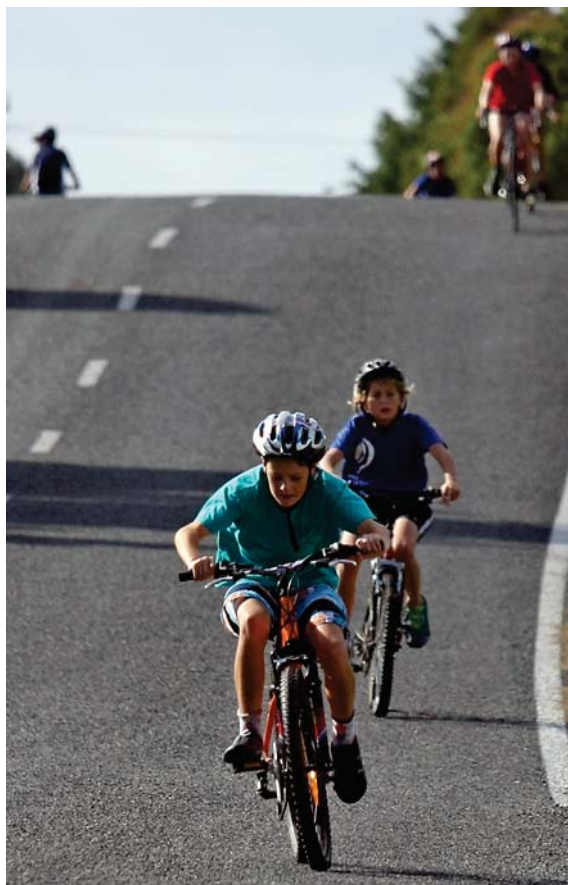
• Triathlon competitors battle it out on the cycling leg