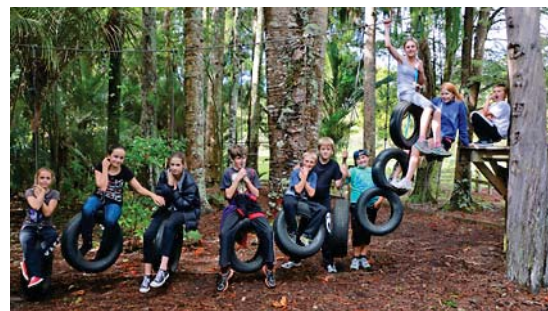
• Helensville School senior students at the camp

The students took part in a range of exciting activities that provided them with fun opportunities to challenge themselves. They included river kayaking, scaling a climbing wall, plunging into an extremely cold waterhole, working their way through a confidence course and testing their nerves on a flying fox zip line.