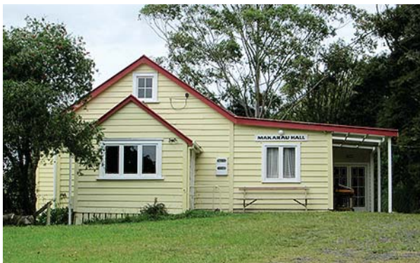
• Makarau hall