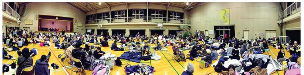
• The evacuation centre where Elley spent five nights in total