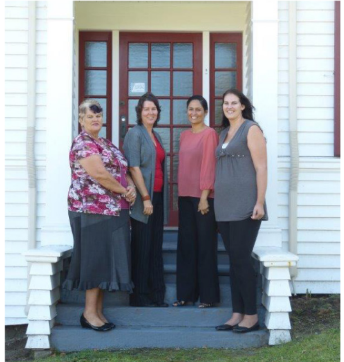
Helensville Women and Family Centre staff at No. 1 Porter Crescent.