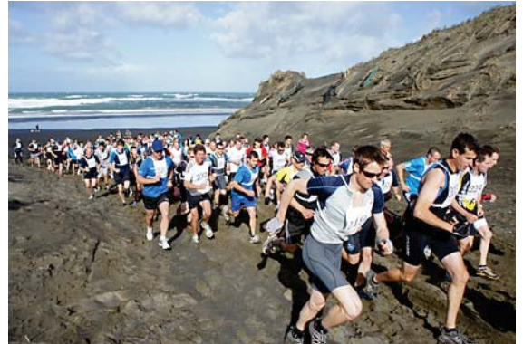
• Competitors at the Muriwai start of last year's Rodney Coast Challenge

individuals and teams of two to four people, who share the different legs of the challenge. The fastest can complete the course in about two hours, with others taking up to five hours to finish the 73km total race length.