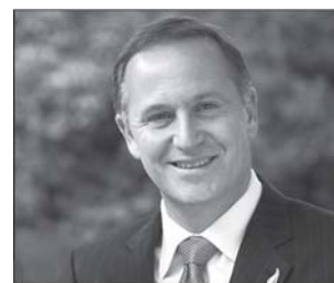
Rt Hon John Key