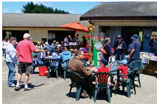
• People relax at last year's Spring Fling