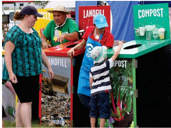
• Special waste stations were well utilised at the A&P Show

It was never anticipated the show would become 100 percent zero waste, and the high percentage of material diverted from landfill has pleased everyone involved with the project.