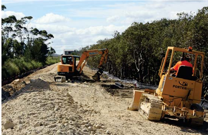
• Heavy machinery puts the finishing touches to the stop bank

Swales were the principle contractors for Stage 1 - around 800m - of the project in 2010, and later in 2011 they carried out slip repair works which also included construction of a large timber retaining wall at the Parkhurst Road end of the job.