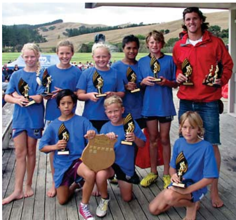
• Intermediate A winners Helensville Gannet