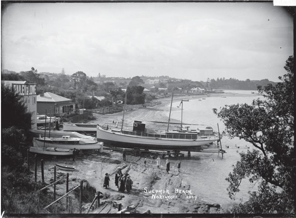
• The Lady Eva at Sulphur Beach, Auckland prior to her launch in 1913