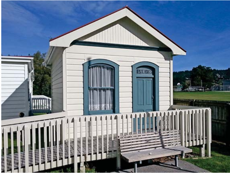
• Historic Kaukapakapa library

"It would not be our intention to re-open as a working library, but more as a museum