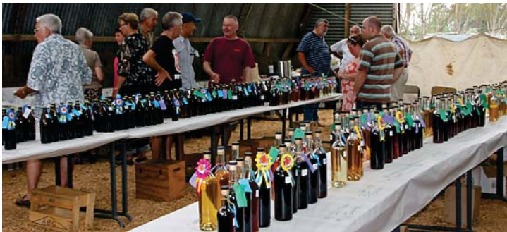
• River Valley Winemakers & Brewers Guild celebrated its 30th anniversary