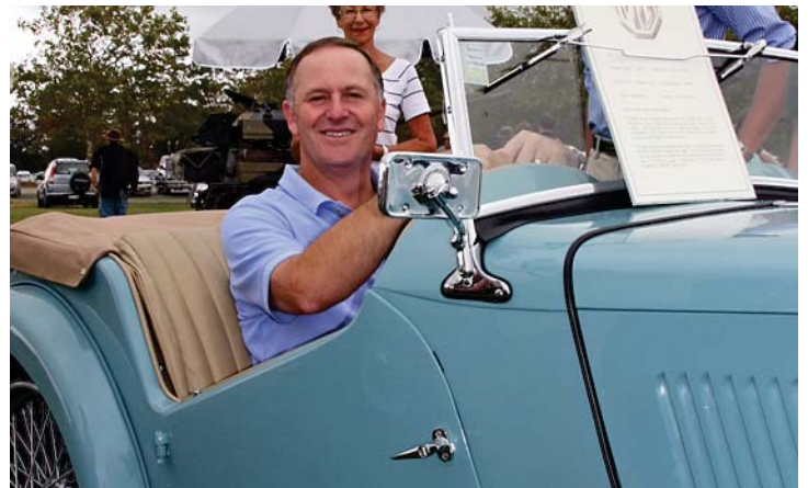
• Prime Minister John Key tries out a classic 1949 MGTC sports car

• All photos © 2014 Helensville News 2011 Ltd