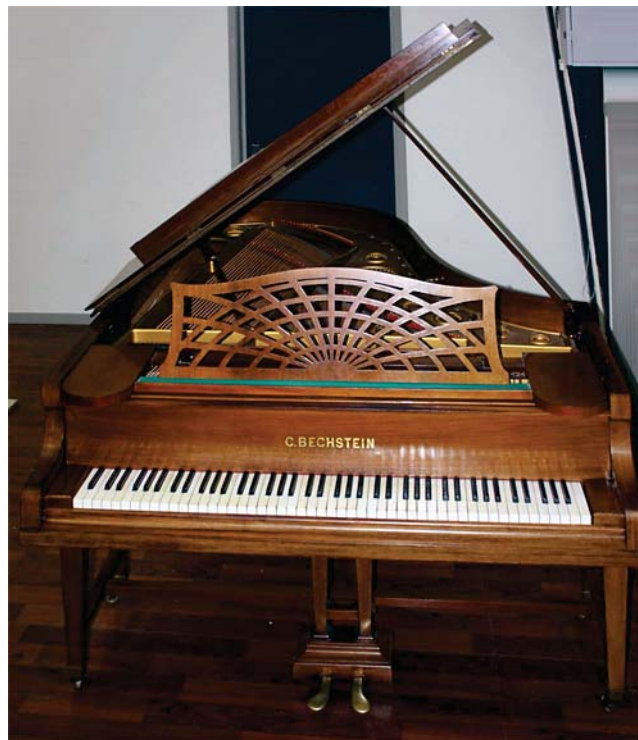
• Kaipara Colleges newly-installed Bechstein grand piano

Anyone with unwanted instruments they would like to donate should phone Nick on 420 8640.