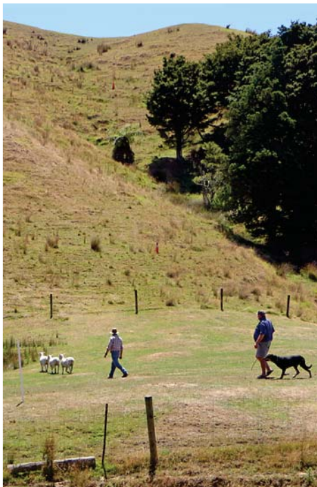
• A competitor in action at the sheepdog trials

Everything used was sourced in Helensville and many in the community made a contribution, either as sponsors or