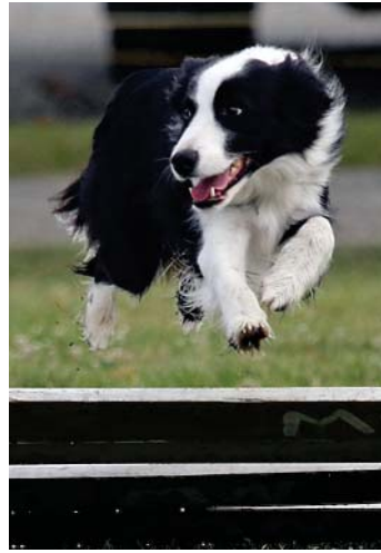
• Butch family dog show