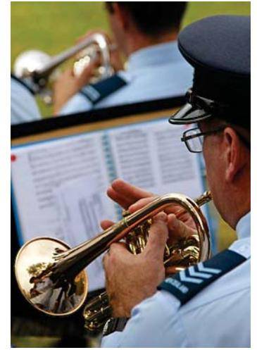
• RNZAF band