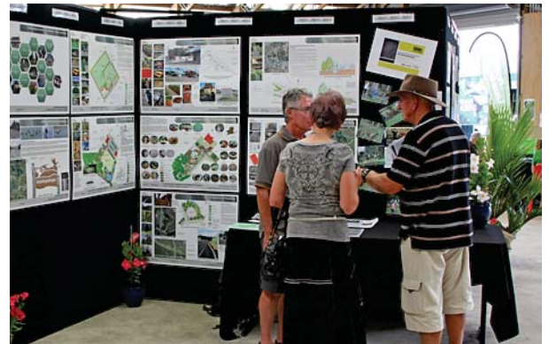
• The Kaukapakapa Community Plan stand

Feedback on Rodney Local Board's plans for 2014-17 close on Friday, March 14. Feedback can be submitted in person at the board office in Orewa, online at www.aucklandcouncil.govt.nz/haveyoursay or via the Rodney Local Board's Facebook page.