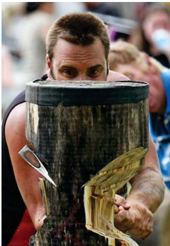
• It's all concentration in the wood chopping arena