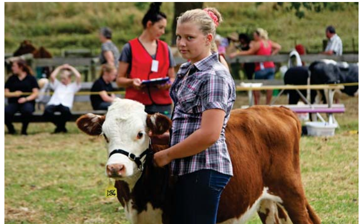
• Cattle - and competitors - come in all ages