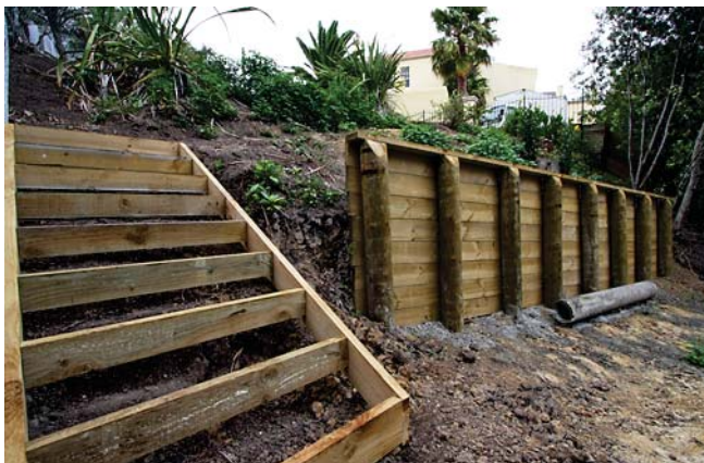
• A retaining wall and stairs are already well under way

The next stage is the formation of the walkway itself, with landscaping to follow.