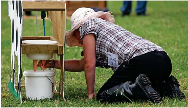
• Competition was fierce in the Junior Farmer competition