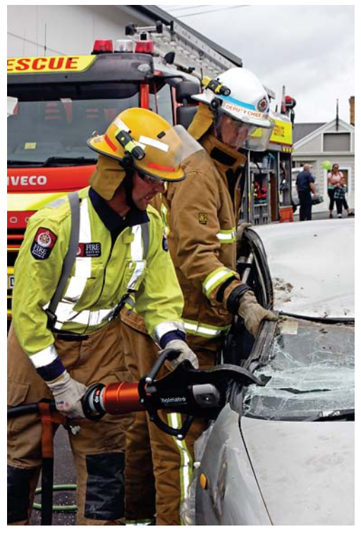
Local fire fighters demonstrate cutting the roof off a crashed car to rescue the occupants

Big crowds turned out to help the Helensville Volunteer Fire Brigade celebrate its centenary last month. Here are some images of the day's action.