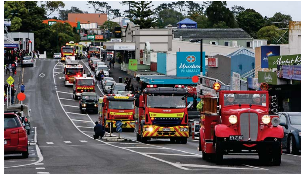
Helensville's first fire engine, a 1936 Chevrolet now owned by the North Shore Vintage Car Club, leads the Helensville Volunteer Fire Brigade procession down Commercial Road to mark 100 years