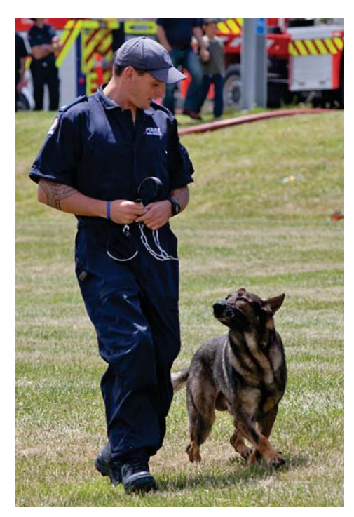
A police dog display will be an event highlight photo: Police Photography Section, Auckland

All local school children will be invited to enter, in one of four age groups. The winners in each group, along with a parent, will get a