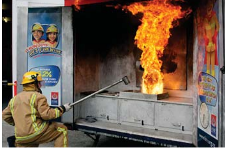
A spectacular demonstration of what happens when water is put on an oil or fat-based fire

Big crowds turned out to help the Helensville Volunteer Fire Brigade celebrate its centenary last month. Here are some images of the day's action.