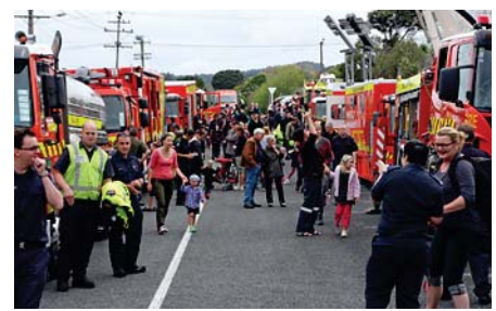
· Crowds enjoy the fire appliances on show