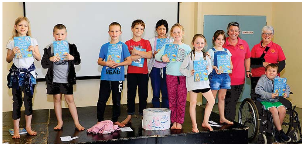
• Waioneke School students with their new dictionaries

South Kaipara Rotary has distributed more than 100 illustrated dictionaries to Year 4 students at local primary schools.