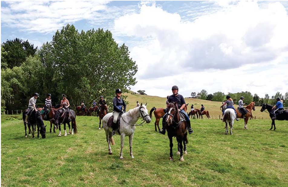
• Some of the trek riders

Ninety riders including six guides came from as far afield as Te Aroha, Port Albert and Kaiwaka to take part in the fourth annual Helensville A&P Association horse trek on Sunday, November 18.