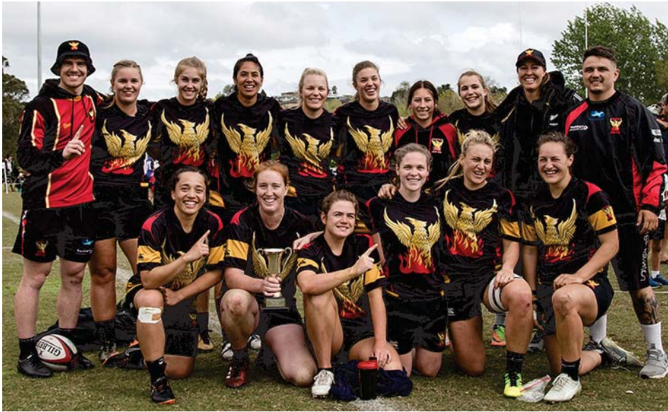
• The victorious Sevens team