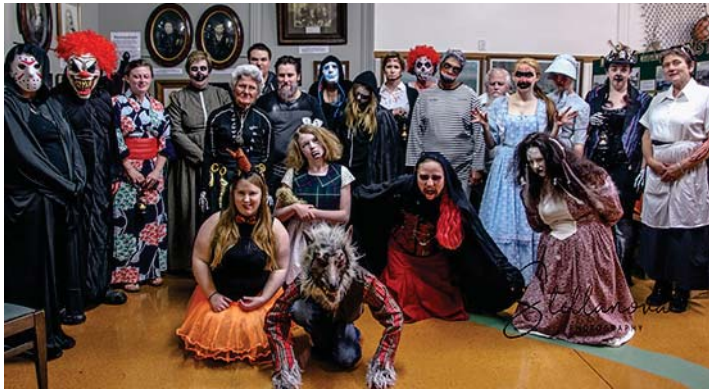
• Scary clown - check. Werewolf - check. Assorted ghouls - check. The cast of volunteers ready to scare

The Haunted House Night is now a regular fixture on the museum's calendar, and new ideas on how to scare people are being sought. Anyone with ideas should contact Lynn in the museum office, phone 420 7881 or email: helensvillemuseum@xtra.co.nz .