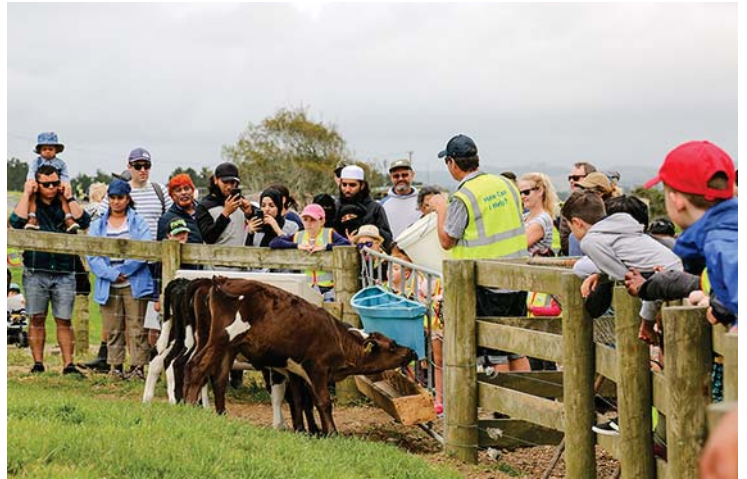
• Visitors watch a calf feeding demonstration at the Helensville farm