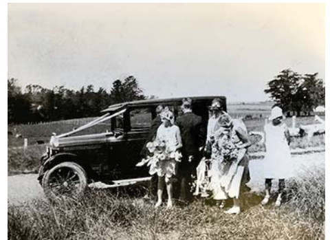
• A historic Kaukapakapa wedding