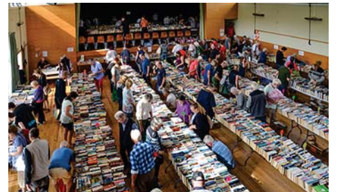
• Locals in their hundreds turn out for the fairs