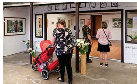
• Visitors check out works in the 'emerging artists' popup gallery