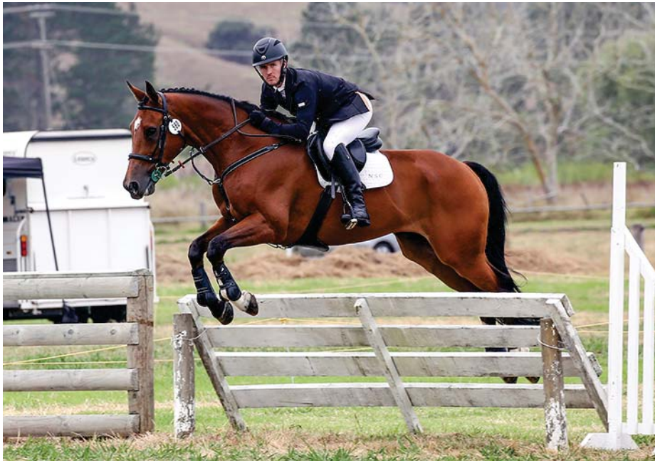
• Below: Showjumping action was as spectacular as ever