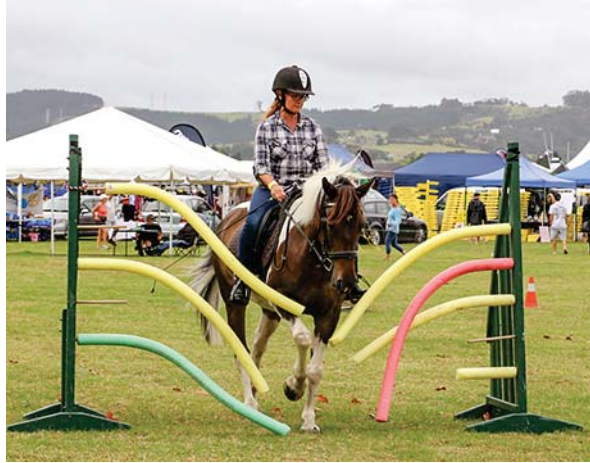
• Riding through a waving pool noodle obstacle

The recently formed Cowboy Challenge North Auckland Club will hold a 'Have a Go'