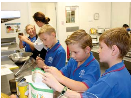
Helensville Primary Students at last year's cooking classes at Te Whare Oranga o Parakai.

Urgent appointments are best made by phoning reception on (09) 420 8400 and talking to the Triage Nurse who will assess your need and make a time to see the Duty Doctor.