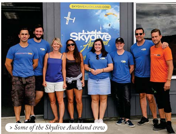
> Some of the Skydive Auckland crew

Skydive Auckland won both the 2018 Westpac Business Awards - Excellence in Community Contribution and the North West Business Awards 2018 Recreation Category and the Overall Supreme Winner 2018