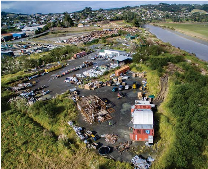
• An aerial view of the Helensville Community Recycling Centre site

Helensville Community Recycling Centre hours under Level 3 are Thursday to Sunday 9am to 3pm. Normal hours will