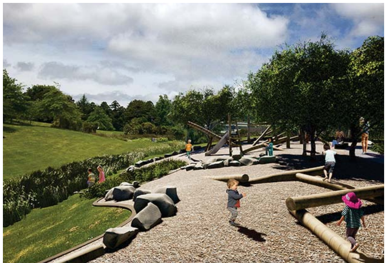
• A designer's impression of the new playground site.

The project's next step will be presentation of feedback to the local board in