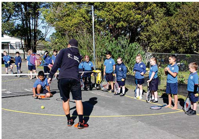
• Tennis coaching at Helensville Primary School

Locals wanting to get back into tennis or who are just starting out can attend a first night for free, and pay just $10 per week for the next two weeks, after which they are expected to join. Every level of player is welcome.