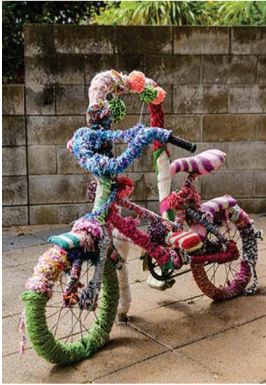
• Stand still too long, and you may end up like this bike outside Helensville Library! Yarn bombing has been a feature of each Arts in the Ville, and was particularly prevalent this year