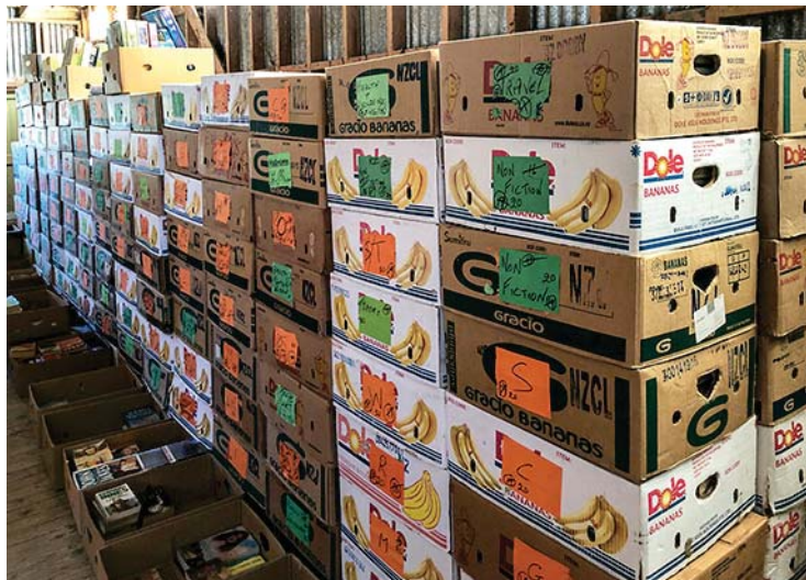
• Packed, stacked and ready to go - literally thousands of books have been stored, sorted and are now ready to sell since the May fair cancellation