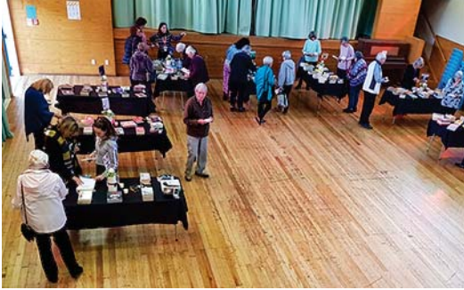
• Checking out the themed tables at the Book Tasting

Each attendee was given a 'Menu and Tasting Notes' brochure, a Doggie Bag receipt, and a bookmark. Handing in the Doggie Bag receipt got them a wrapped Mystery Book.