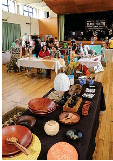
• Artists - and art lovers - packed the Helensville hall