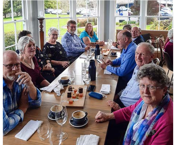
• Celebrating 60 years of the Lions Club in Helensville