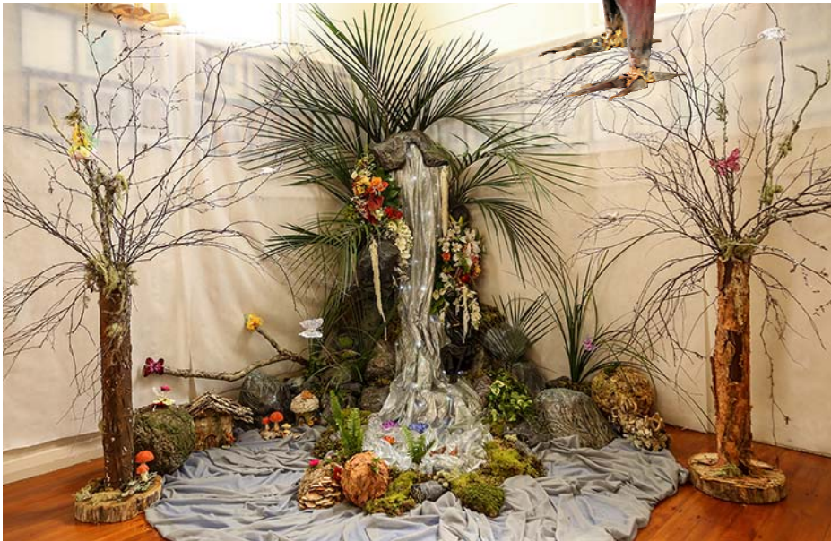
• Above & Right: Parts of the Enchanted Garden exhibit 'grown' by the Helensville Floral Art Club in the Duke of Albany Lodge building