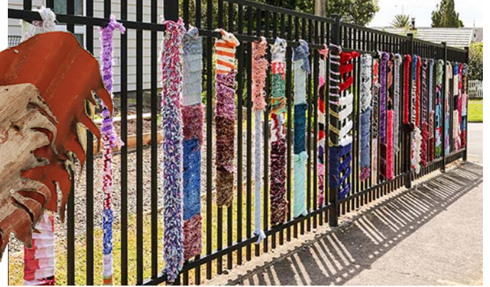
• Above: 'Yarn bombing' all over town heralded Arts in the Ville 2022