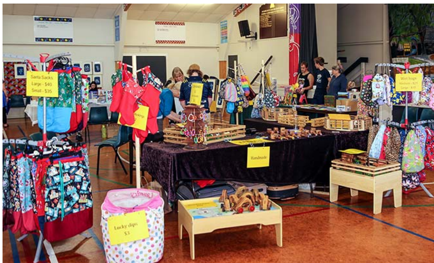
• Left: The new Makers' Market was a popular venue with a wide range of art and crafts on offer