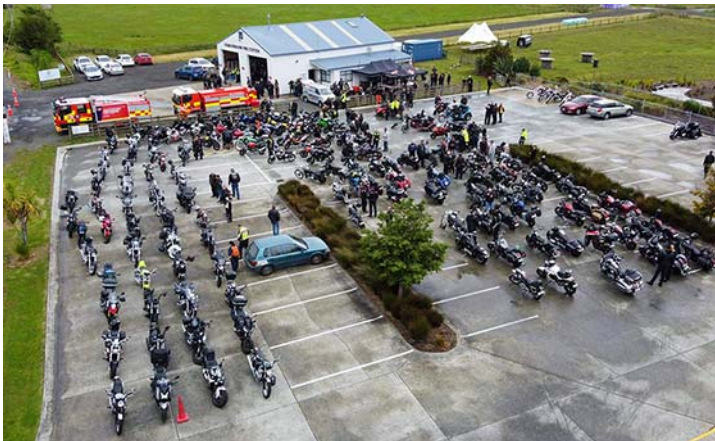
• Around 150 motorbikes assembled outside Kaukapakapa fire station for the last Poker Run

Now in its 16th year, the popular motorcycle event usually attracts around 150 to 200 motorcyclists, who follow a scenic route around the area calling in at each of the five local fire stations, at Helensville, Shelly