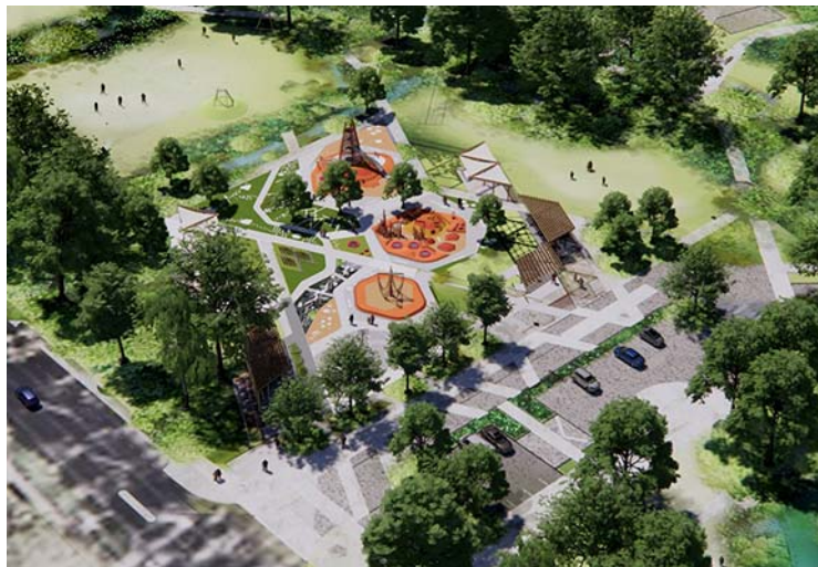
• An artist's impression of the finished recreation area

Cyclone Gabrielle with 24 trees uprooted, including several cherished English oaks. The campground had to be closed for repair and maintenance from storm damage but is now partially open with Pūkoro bach and Mahana tiny home bookable on the Auckland Council website. Self-contained motor sites remain closed for now.