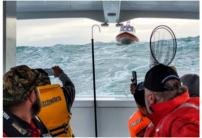
• Passengers on Amara watch as Coastguard Helensville's Winstone Rescue vessel crests a huge wave during the bar crossing