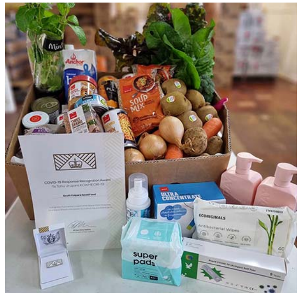
• The award, with a sample isolation pack

Kai Learn has facilitated more than 65 cooking classes. Kai Grow has planted more than 600sq.m. of community, urban and market gardens, while more than 96,000kg of food has been saved from going to landfill by Kai Rescue.