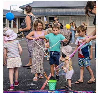
• Children's Day 2023 fun

Children's Day focuses on the well-being and happiness of our tamariki and community connections.