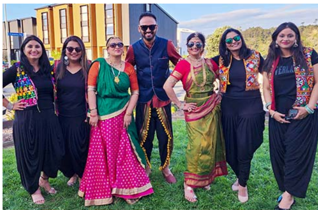
• The Pan Indian Rifles dancers will perform for the first time