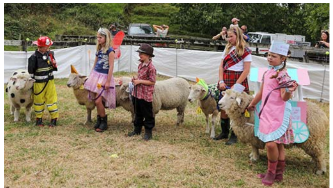
• Pet lambs are an iconic part of Helensville Show

demonstrating his trade with an interactive aspect.