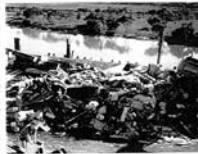
(mountain of rubbish)