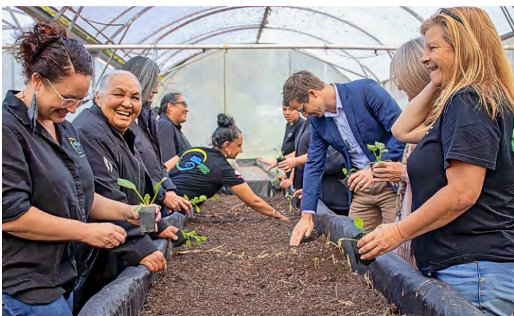
• Planting seedlings at the opening of the Mihirau Greenhouse