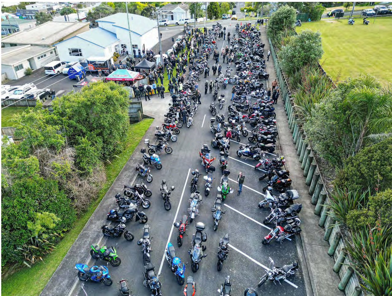
• Motorbikes cover Makiri Street in Helensville for the Poker Run