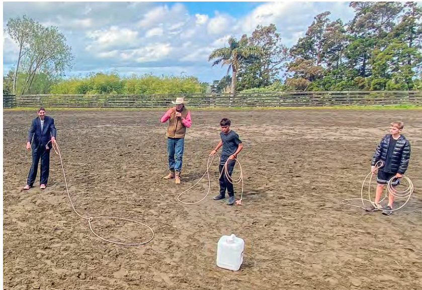
• Trying out lassoing at the boys day

Feeling Fab's goal is to take their programme to small towns