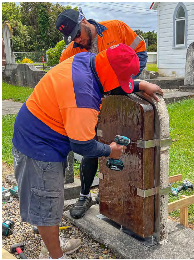
• Above: workers put the finishing touches on the final headstone and Below: the restored Johnstone headstone