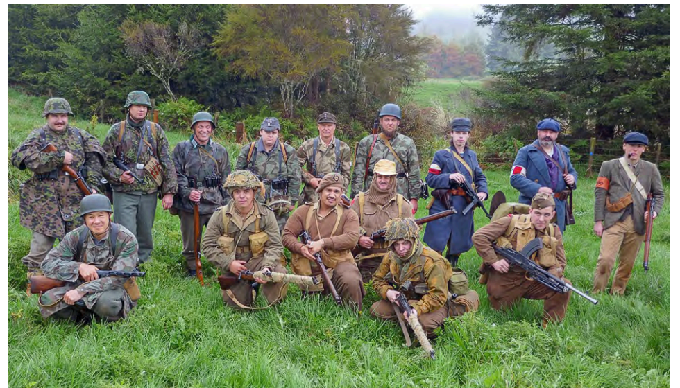
• Members of the WWII Historical Re-enactment Society

For more on Helensville Show attractions see pages 2, 4, 7, 9, and 10.