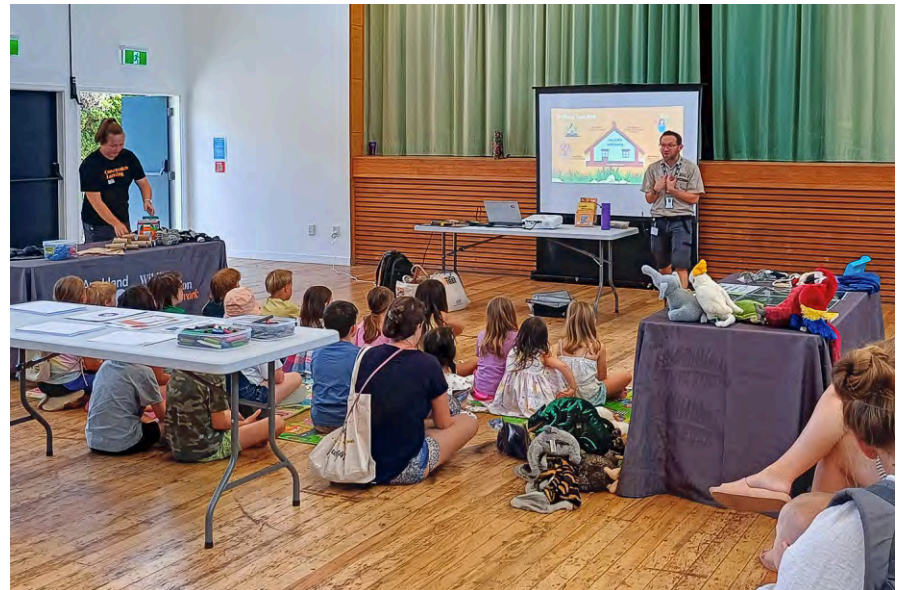
• Children listening to Nic from Auckland Zoo

More information on children's classes is available